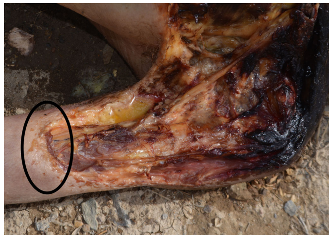
FIG. 3—Small, irregular defects peripheral to the scavenged area on the left arm in Case 2.

Small, linear striae were observed on the left arm, distal to both the scavenged area and the previously described peripheral defects. These striae were accompanied by both small and large