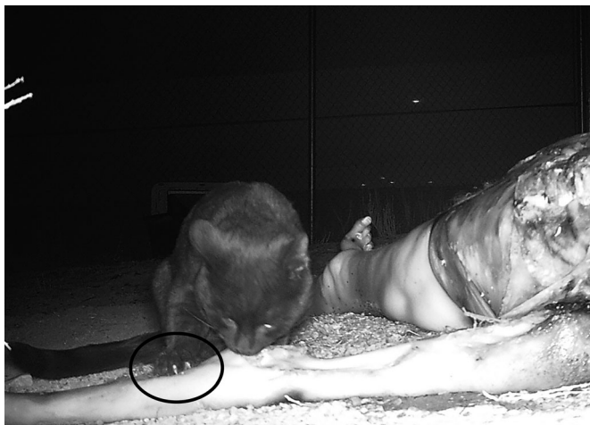
FIG. 5—Game camera image of the cat using its claws to stabilize the arm as it consumes tissue in Case 2.

had been previously penetrated. The abdomen was a secondary area of interest (Table 2). These two cases more closely parallel the reported pattern of bobcat scavenging (1) than that of the domestic Felis catus .