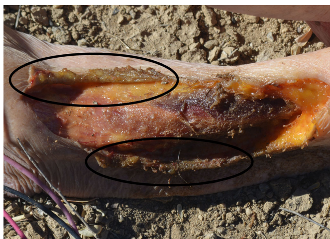
FIG. 2—Outer layers of tissue pulled back (reflected) to expose underlying tissue in Case 1.

A game camera photographed a black cat, a different animal from that which scavenged Case 1, tearing tissue from the donor. After the initial scavenging event, what appeared to be the same cat returned for 10 of the next 16 nights, then after a month-long hiatus, it returned for two nights. On each night, the cat visited the same body multiple times. The scavenging occurred between 63–339 ADD and a TBS range of 11–16 (Table 1). Scavenging stopped at the onset of moist decomposition.